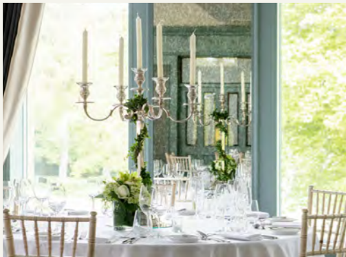
The Palmer Room

The Palmer Room is a purpose-designed space ideal for hosting a medium-sized wedding celebration. Located in the chic Palmer Clubhouse, its adjoining terrace is ideal for an afternoon drinks reception and features its own private entrance and bar.