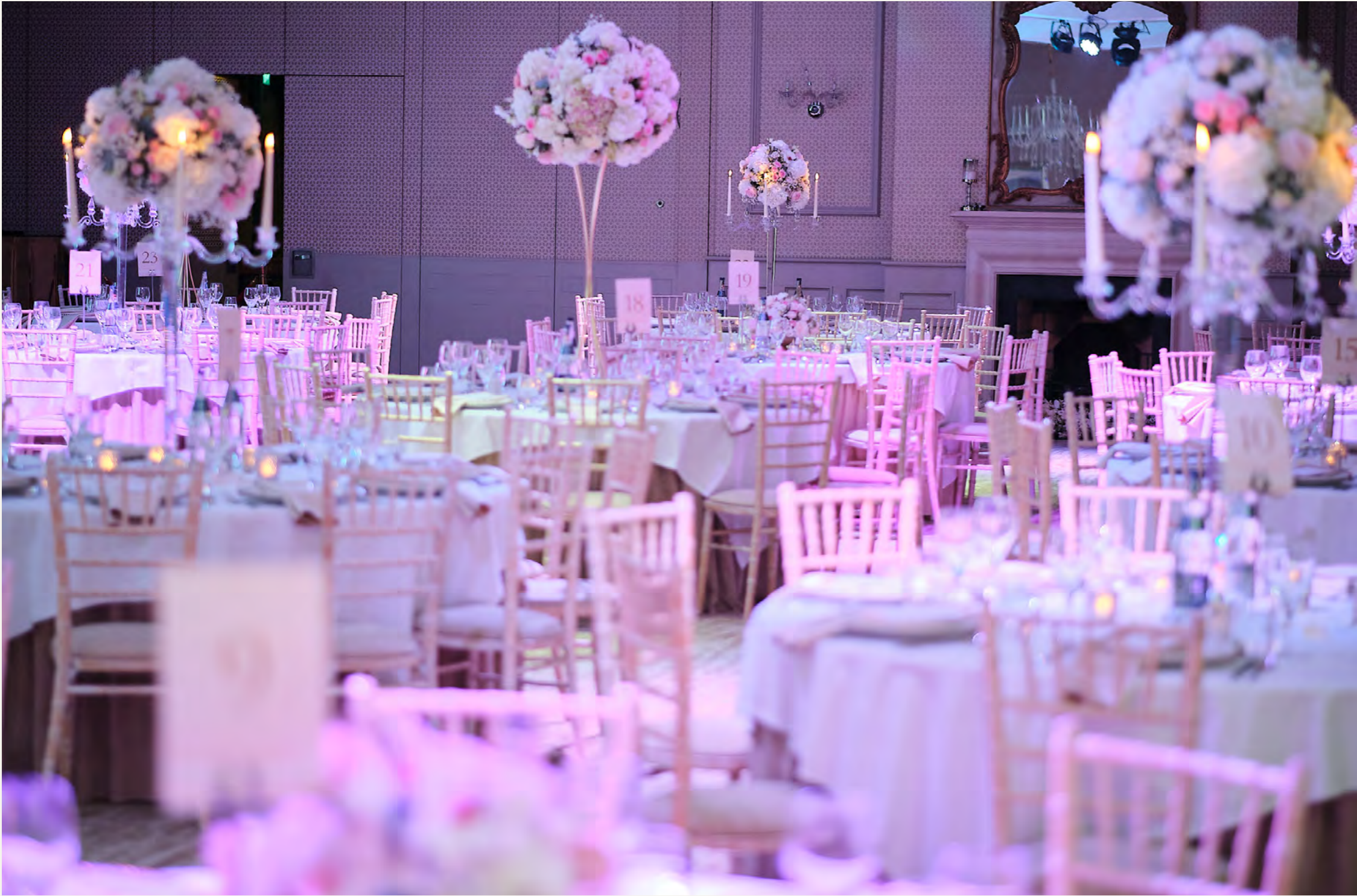
The Legacy Suite